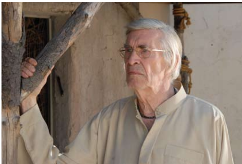
Rabbi Schmulic (Martin Landau) sees little hope in David & Fatima's future